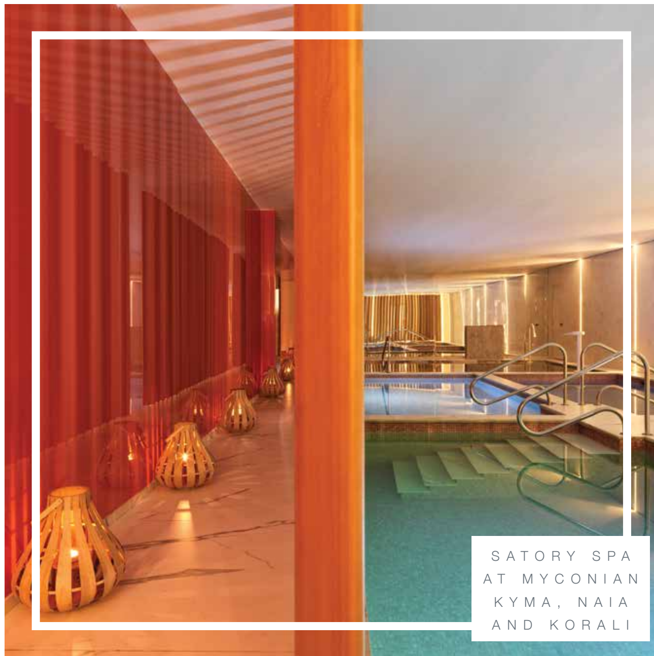
SATORY SPA AT MYCONIAN KYMA, NAIA AND KORALI